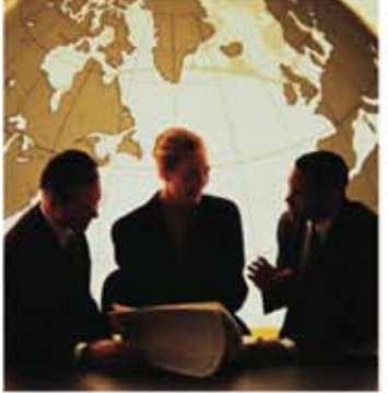
Global Service Only a Click Away