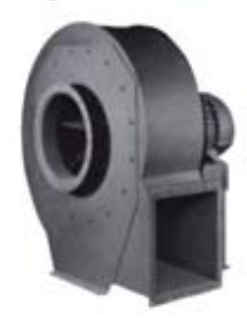
FLANGED INLET & OUTLET- Pre-punched flanged inlet and outlet simplify duct connection. Inlet flange is a formed steel ring bolted to the inlet. Outlet flange is flat bar welded to housing discharge.